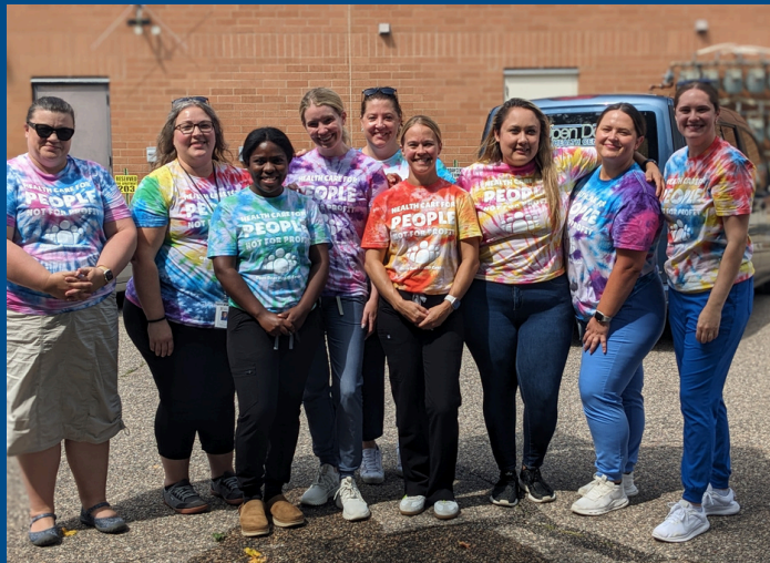
ODHC staff celebrate National Health Center Week in Jordan